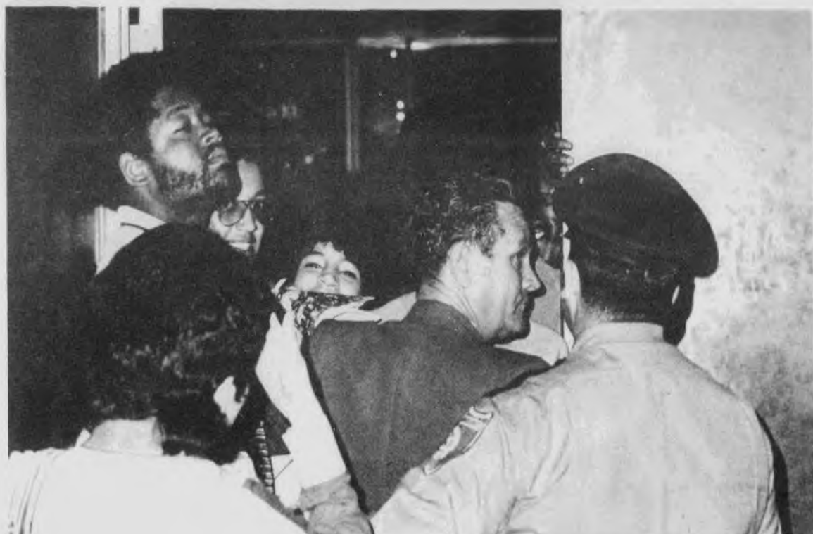
"LET US IN" or lose the doors. A crowd of students tried to get in to see activist Angela Davis Monday night in the Houston Room, UC. There were eventually allowed to enter and filled the room well beyond capacity.