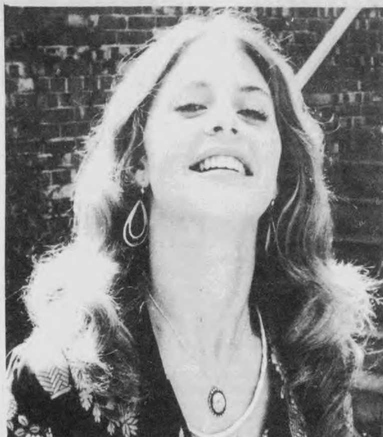
"FINALLY I HIT the big time. I played a victim," Lindsay Wagner said of her three appearances on Marcus Welby. Currently, Wagner is co-starring with Peter Fonda in "Two People" at the River Oaks Theatre.

Prey has performed operatic roles in Tokyo, Rome, Moscow, Vienna, London, Berlin, New York and Chicago. He is one of the foremost interpreters of the German lieder.