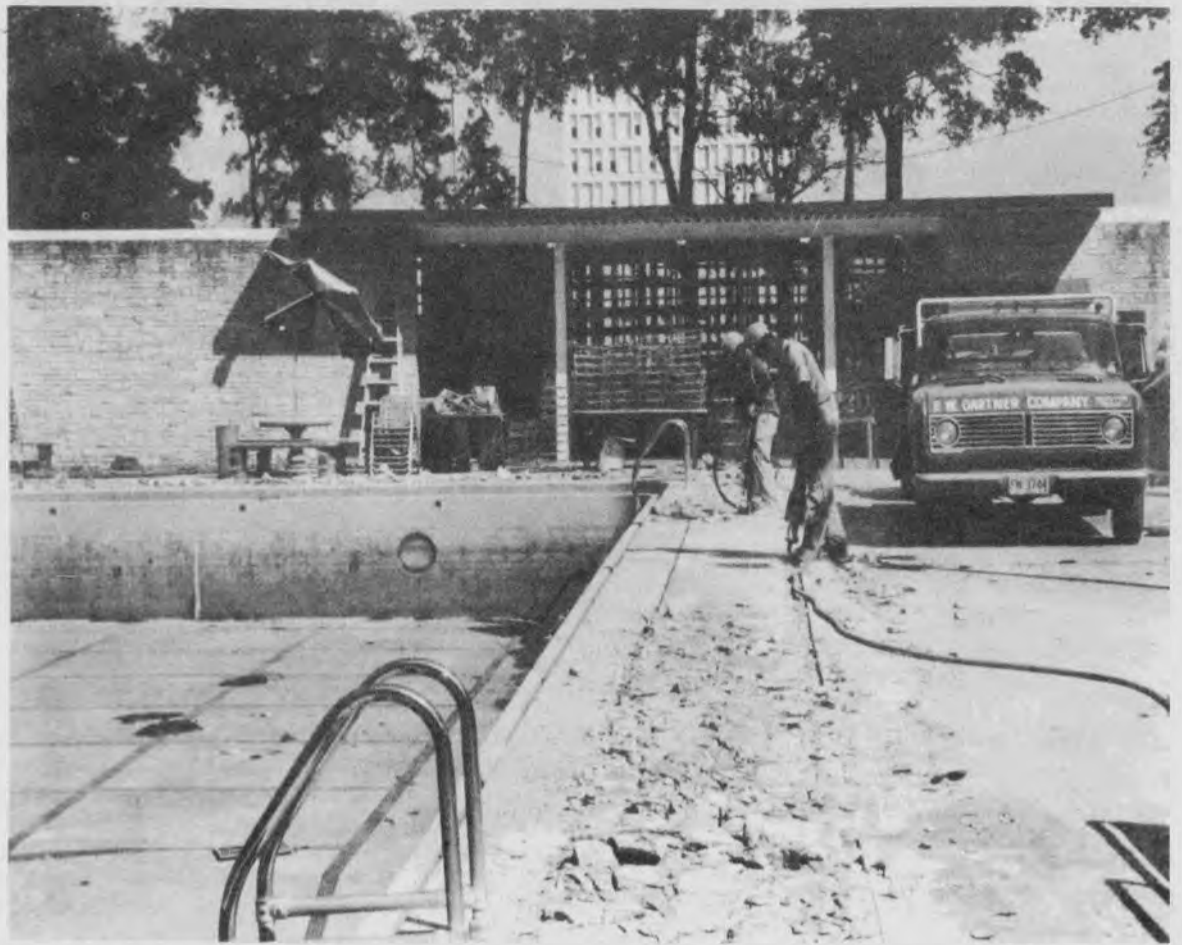
RENOVATION of the outdoor pool next to the Student Life Building will be completed by the summer. The Board of Regents recently approved funds for the work.