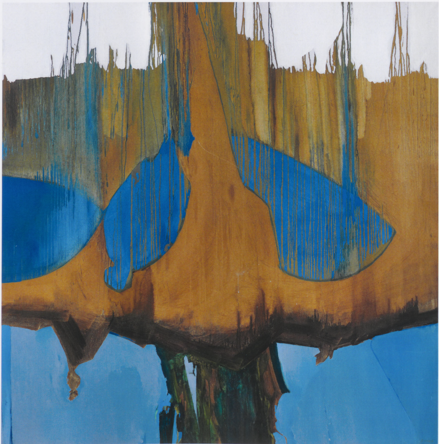
Ascent of a Hero 1968 Oil on canvas 60 x 60 in. Fayez Sarofim Collection