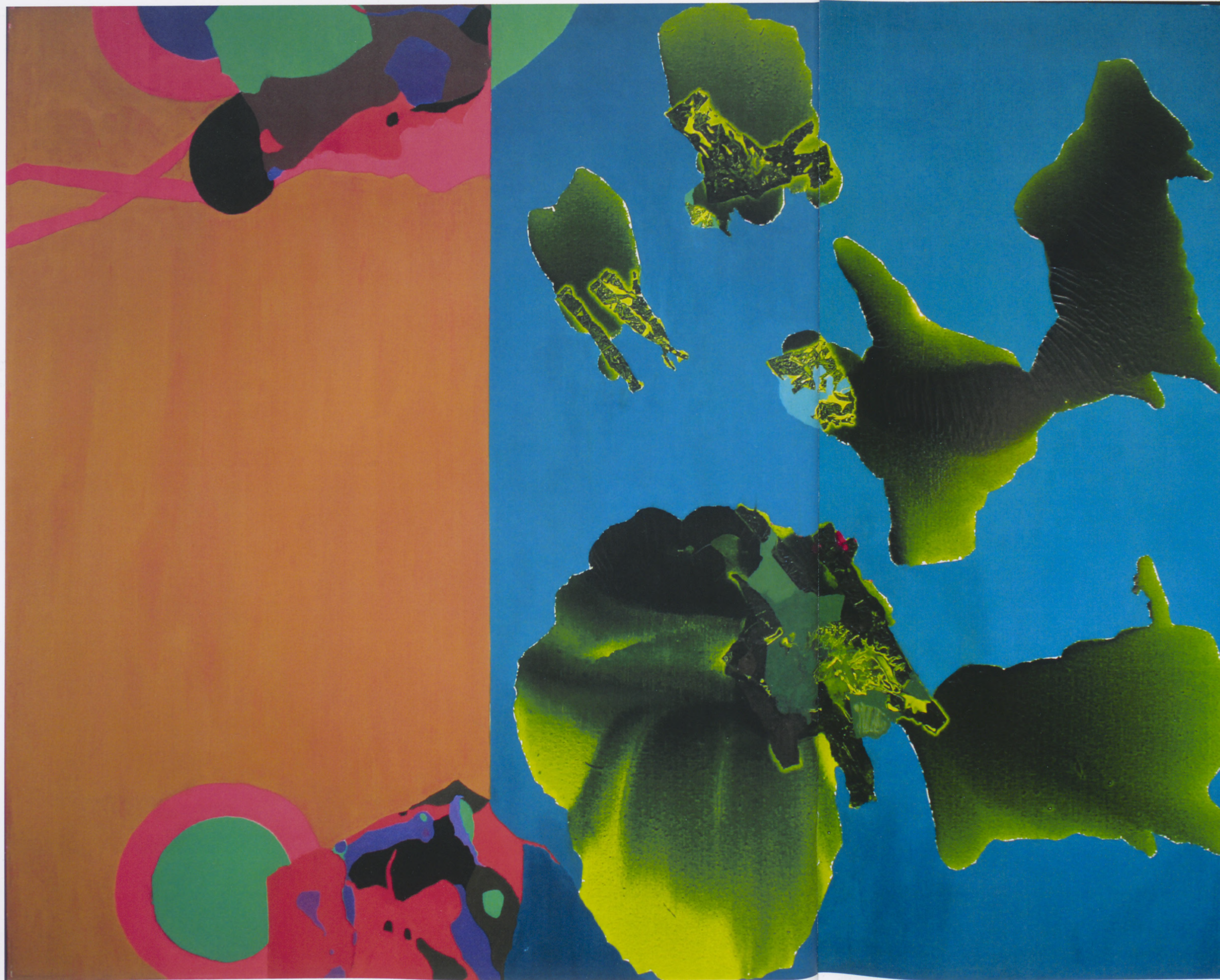
Untitled 1980s Oil on canvas 70 x 90 in. Art Museum of South Texas, Corpus Christi