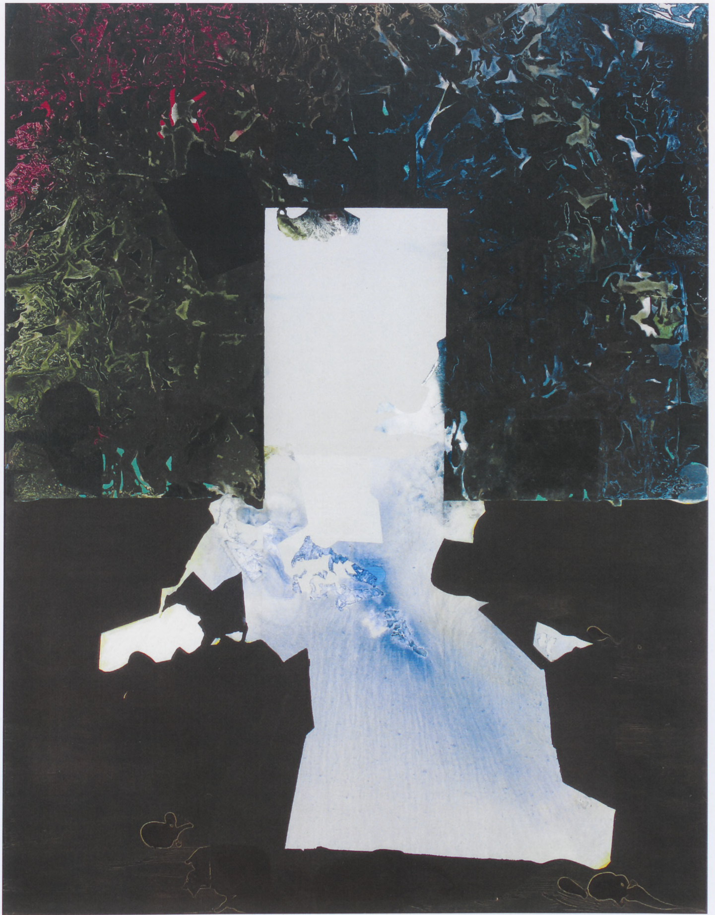
Obelisk 1994 Oil on canvas 90 x 75 in.

The Andrews Kurth Collection, Houston, Texas