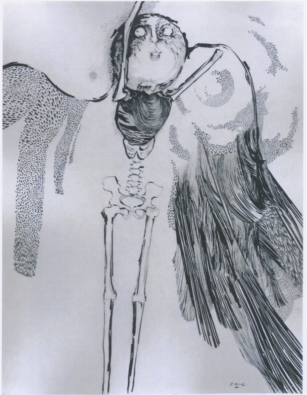
Devastated Child Without Armor c. 1961