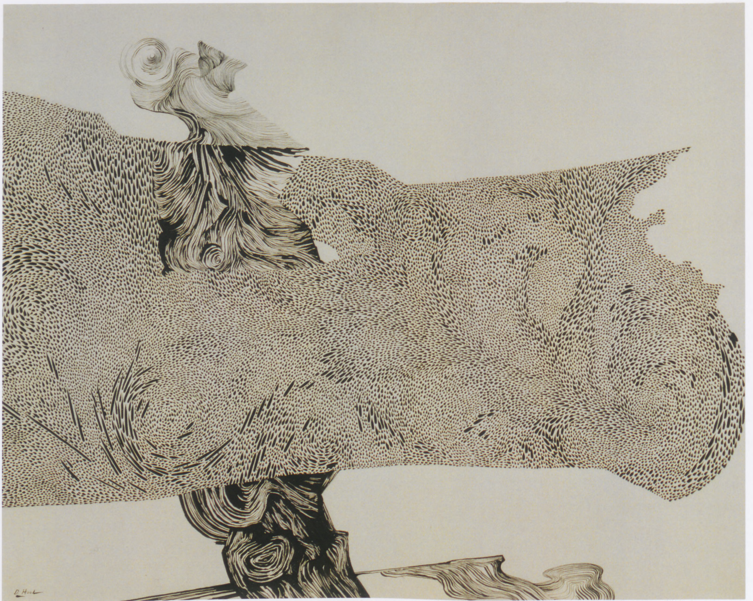
Devastated Log with Emerging Spirit 1961