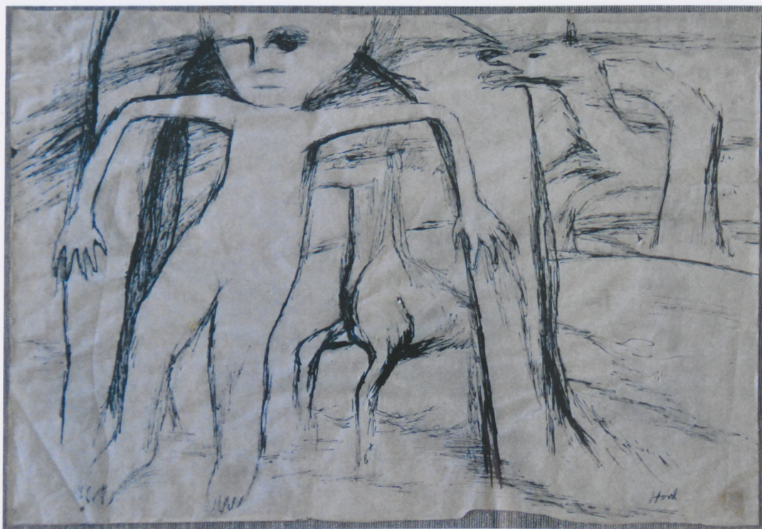
below, bottom She Is Unprepared for These Problems 1942 Ink on paper 25⅞ x 19½ in. Art Museum of South Texas, Corpus Christi