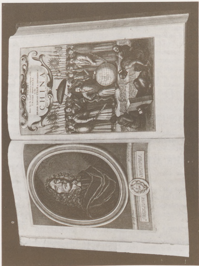
Item 86. Ogilby, John. Asia, the first part . . . 1673.