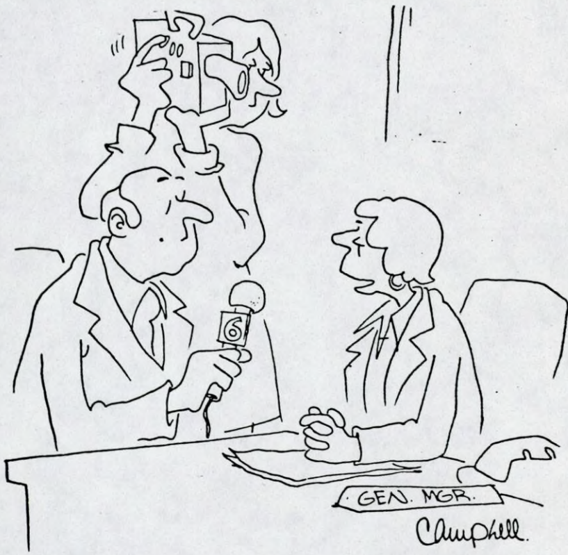
"I owe my career to my husband who inspired me with these words: As long as I pay the bills around here, you will do what I say."

PAR (People Against Rape) have certified nine new rape victim advocates. They and our five trainers were honored with certificates and a party at the end of 25 hours training. Our next big project is incorporation.