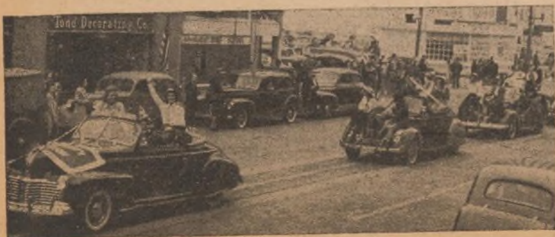
Above are seen a group of Buckaroos who rode in the parade opening the 1941 Fat Stock Show and Rodeo.