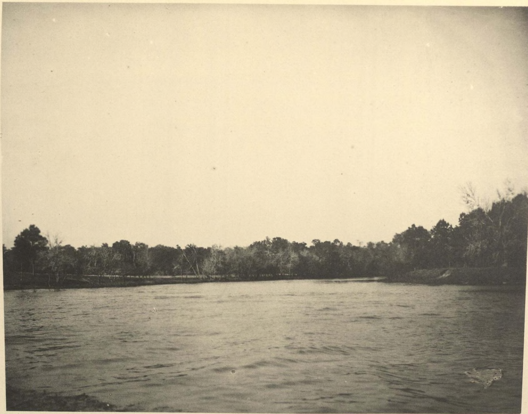
SCENE ON BUFFALO BAYOU.