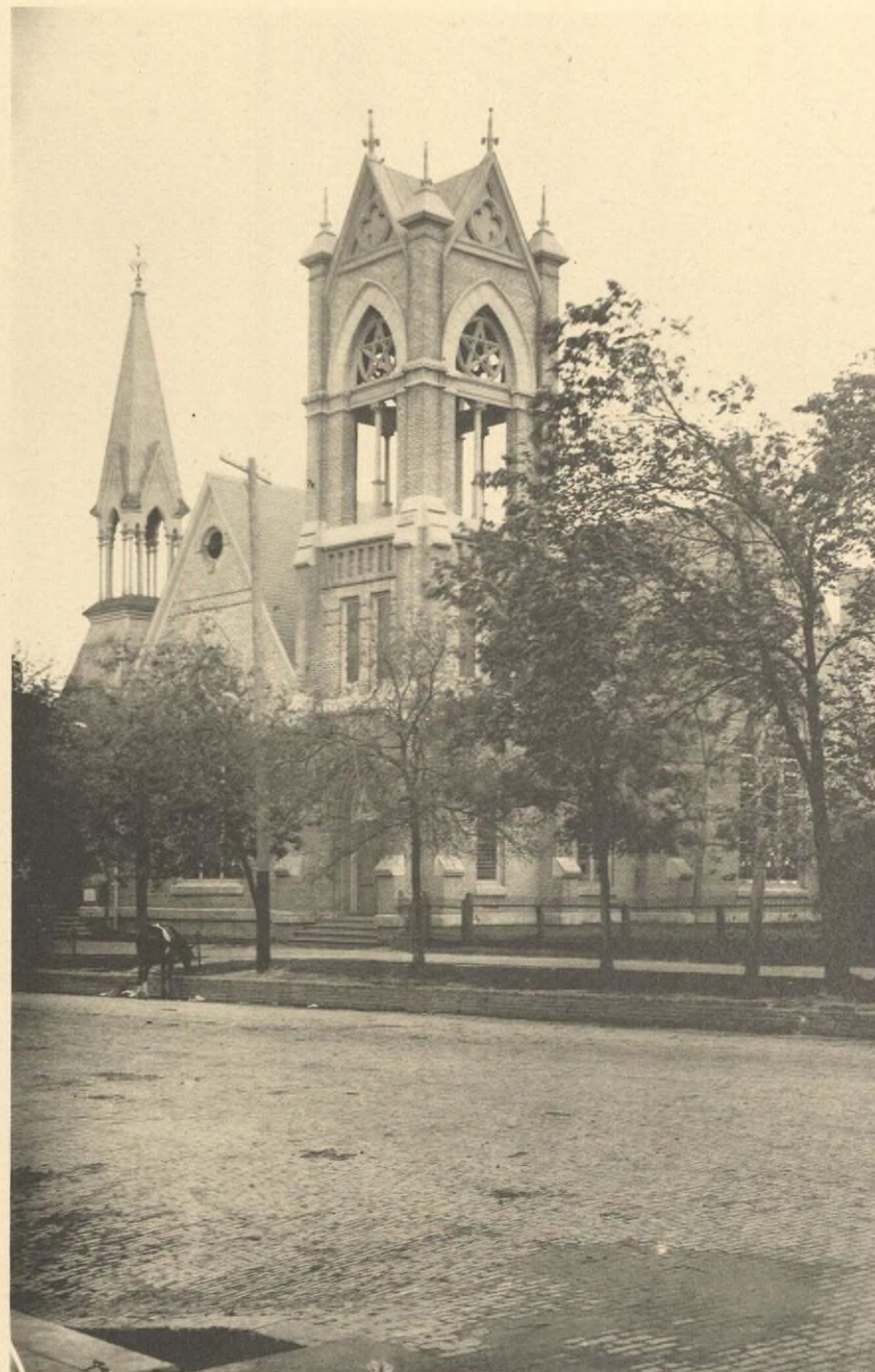
SHEARN MEMORIAL M. E. CHURCH.