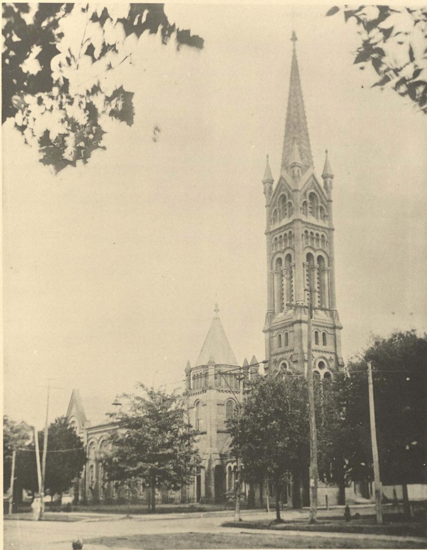
CHURCH OF THE ANNUNCIATION.