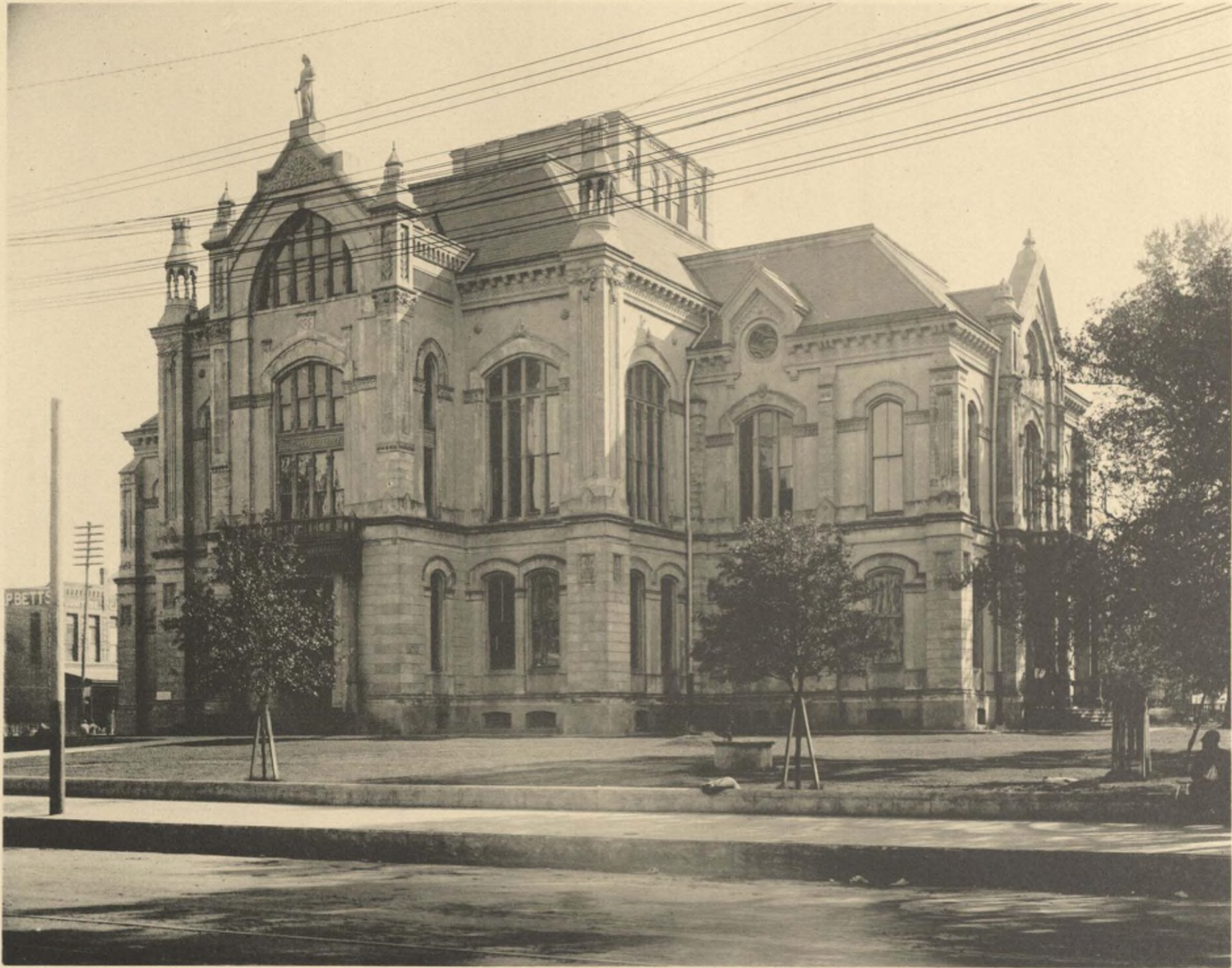
THE COURT HOUSE.