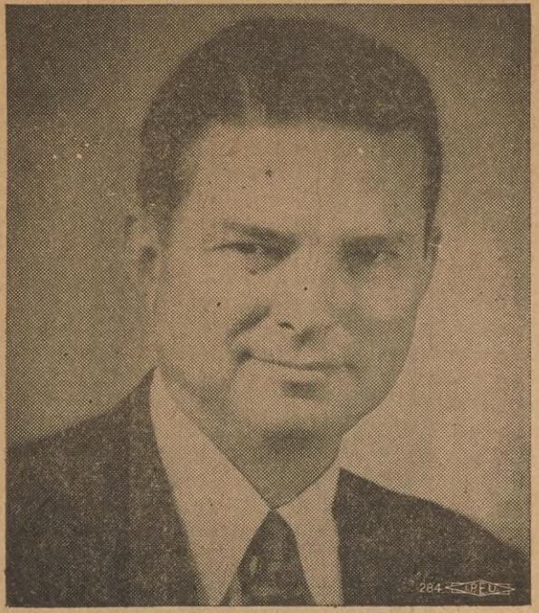
Campaign Headquarters 2315 Fannin Phone BL-1451