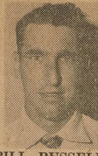
BILL RUSSELL UH Student