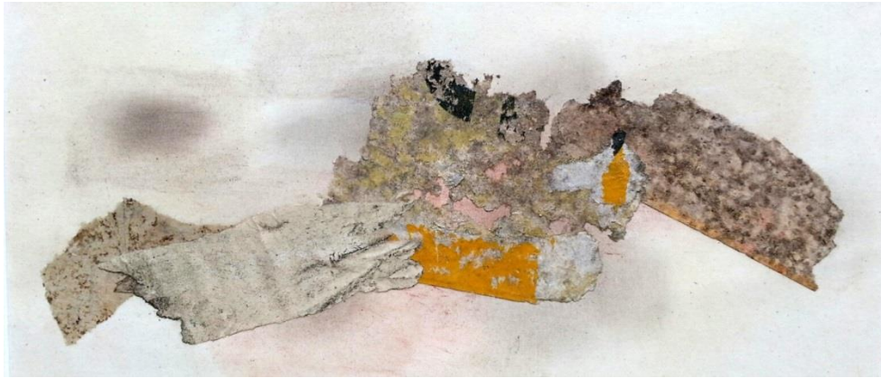
Gene Charlton [Untitled collage] 1959