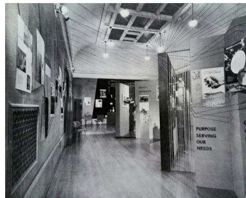
This Was Contemporary Art installation views, 1948