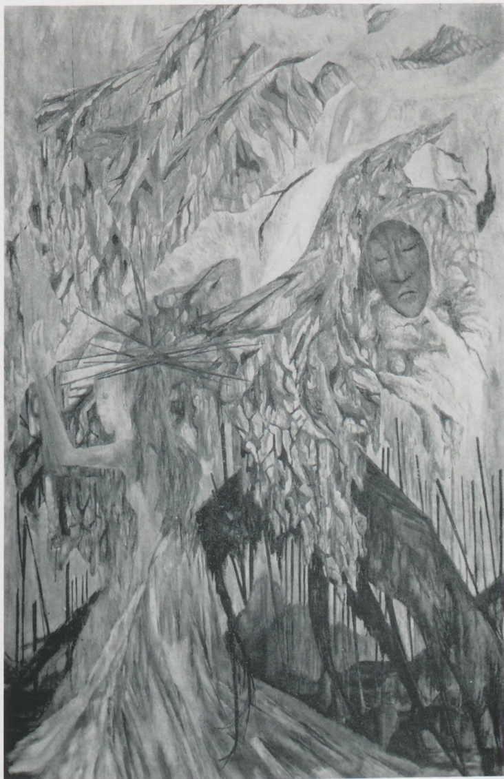
FOR WHICH YOU PASS 1948