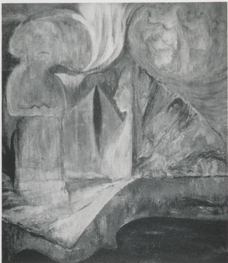
MOON MYTH 1947