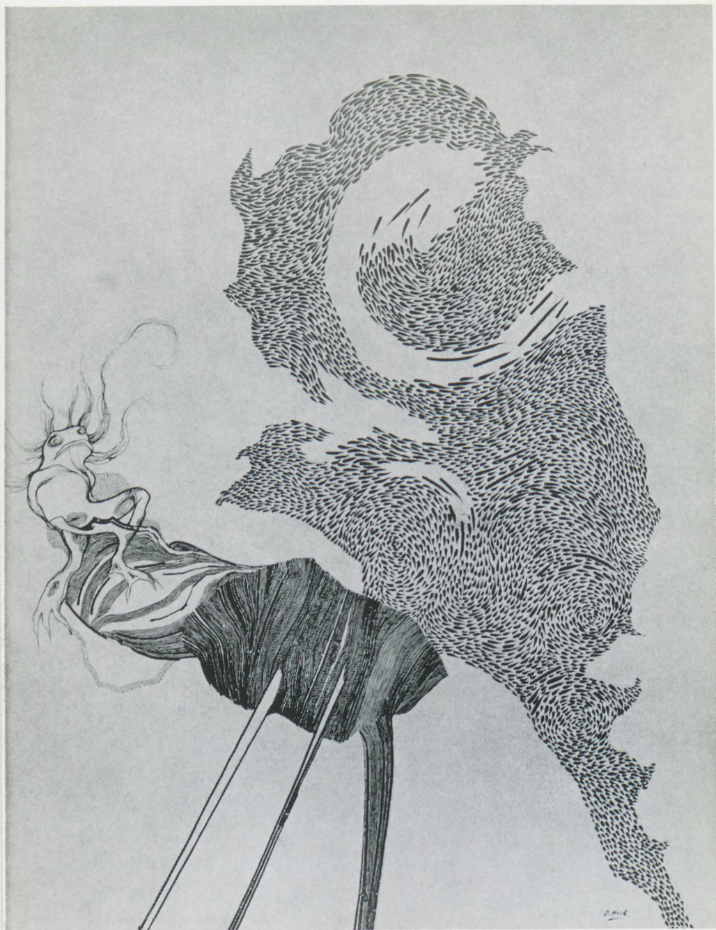
FROG METAMORPHOSIZING INTO THE SUN