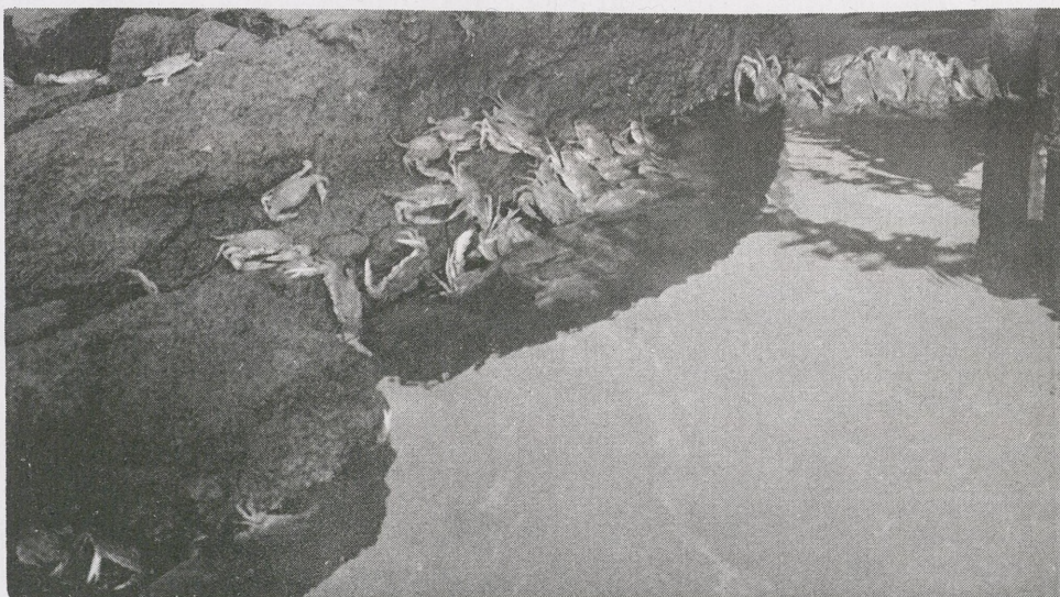
Crab fanciers take note. Crabs are everywhere. On the rocks. On the pipes. And in the water. Where? Down at the docks. That's where.