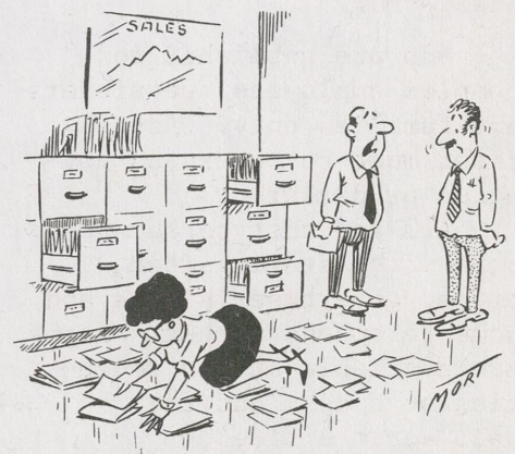
"YOU tell her we already found it - she'll come up fighting!"