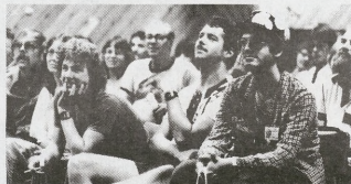
Whatever it was, it must have been fascinating.