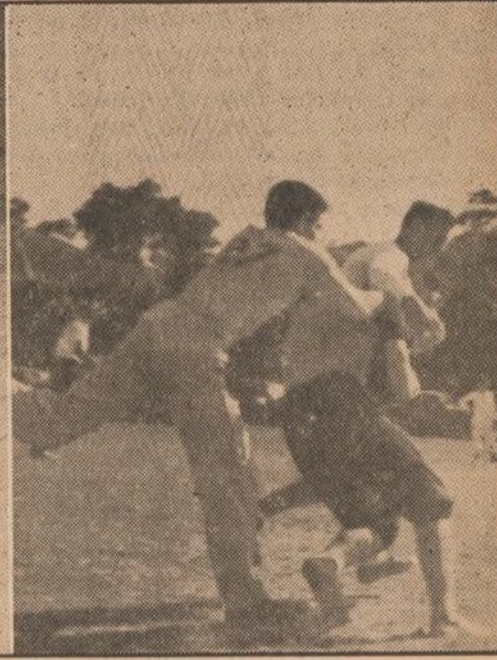
of the frosh professionals on an end run. Despite the addition to the freshman ranks of this Hughes Tool star and other professionals the frosh went down into defeat for the second consecutive week. Score 7-6.