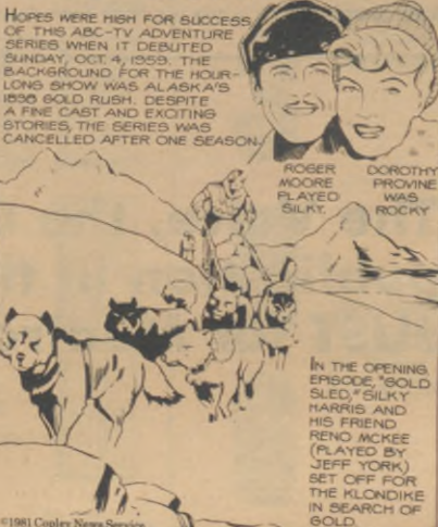
ROGER MOORE PLAYED SILKY. DOROTHY PROVINE WAS ROCKY.

HOPES WERE HIGH FOR SUCCESS OF THIS ABC-TV ADVENTURE SERIES WHEN IT DEBUTED SUNDAY, OCT. 4, 1953. THE BACKGROUND FOR THE HOUR-LONG SHOW WAS ALASKA'S 1930 GOLD RUSH. DESPITE A FINE CAST AND EXCITING STORIES, THE SERIES WAS CANCELLED AFTER ONE SEASON.