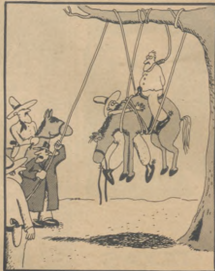
"Okay, okay, okay . . . Everyone just calm down and we'll try this thing one more time."