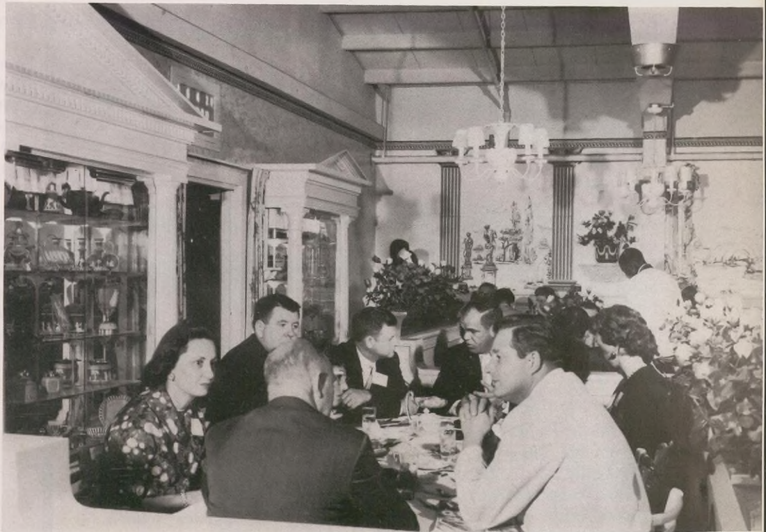
A view of the dining room.