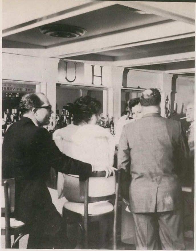
The new bar: the "UH" is fashioned of translucent glass in red and white.