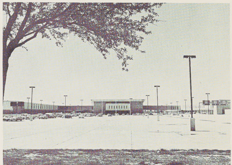
Shreveport Regional Airport, Shreveport, Louisiana. Total construction cost $7,500,000. Air conditioning design by Bovay Engineers, Inc. Baton Rouge, La. Cost of Air Conditioning System - $600,000. Designed to accommodate 500,000 enplaned passengers in 1980. Dedicated October 31, 1971.