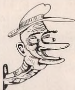
(6) He fades to pass . . . (7) It's a little too long..