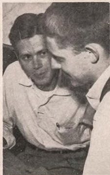
Architectural Students Plan Series

Six of the nation's outstanding architects are in town for a lecture series sponsored by the UH Architectural Society. Visiting lecturers are Buckminster Fuller , Henry R. Hitchcock , Philip Johnson , Ludwig Mies Van Der Rohe , Alfred Roth and Ero Saarinen . First lecture was October 20 . . . remaining lectures are set for November 17, January 7, February 11, April 1 and May 6 in MD Anderson Library auditorium. Series tickets sell for $10 . . . will be used for a traveling scholarship for the outstanding 5th year architecture student.