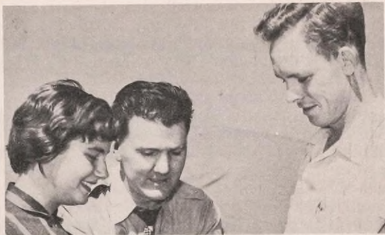
GOLDEN (center) and STUDENTS