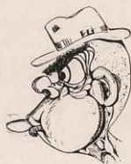
(4) Salute to Referee