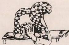
(9) 4th Down - 2 to go