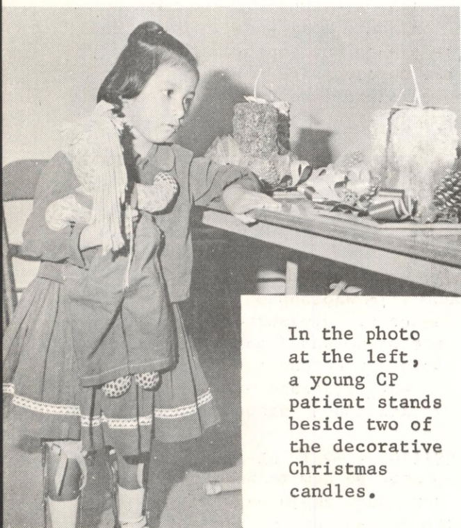
In the photo at the left, a young CP patient stands beside two of the decorative Christmas candles.