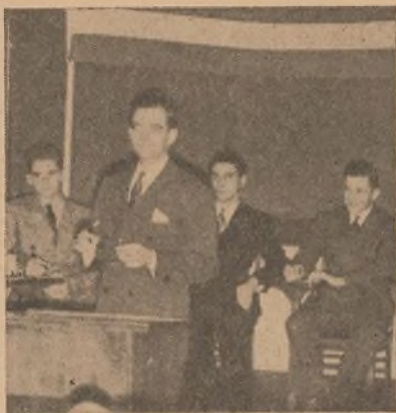
Above is Congressman Albert Thomas, as he spoke to a large audience in the Cullen building last Friday, under the sponsorship of the Young American Forum.