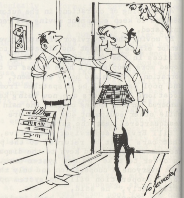
"Tommy must be getting serious. He wants me to start looking for a job!"