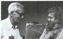
Fritz Leiber, Karl Edward Wagner