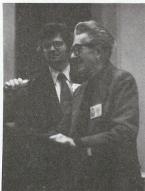
David Hartwell, Frank Belknap Long

The Fifth World Fantasy Convention will be held in Providence,