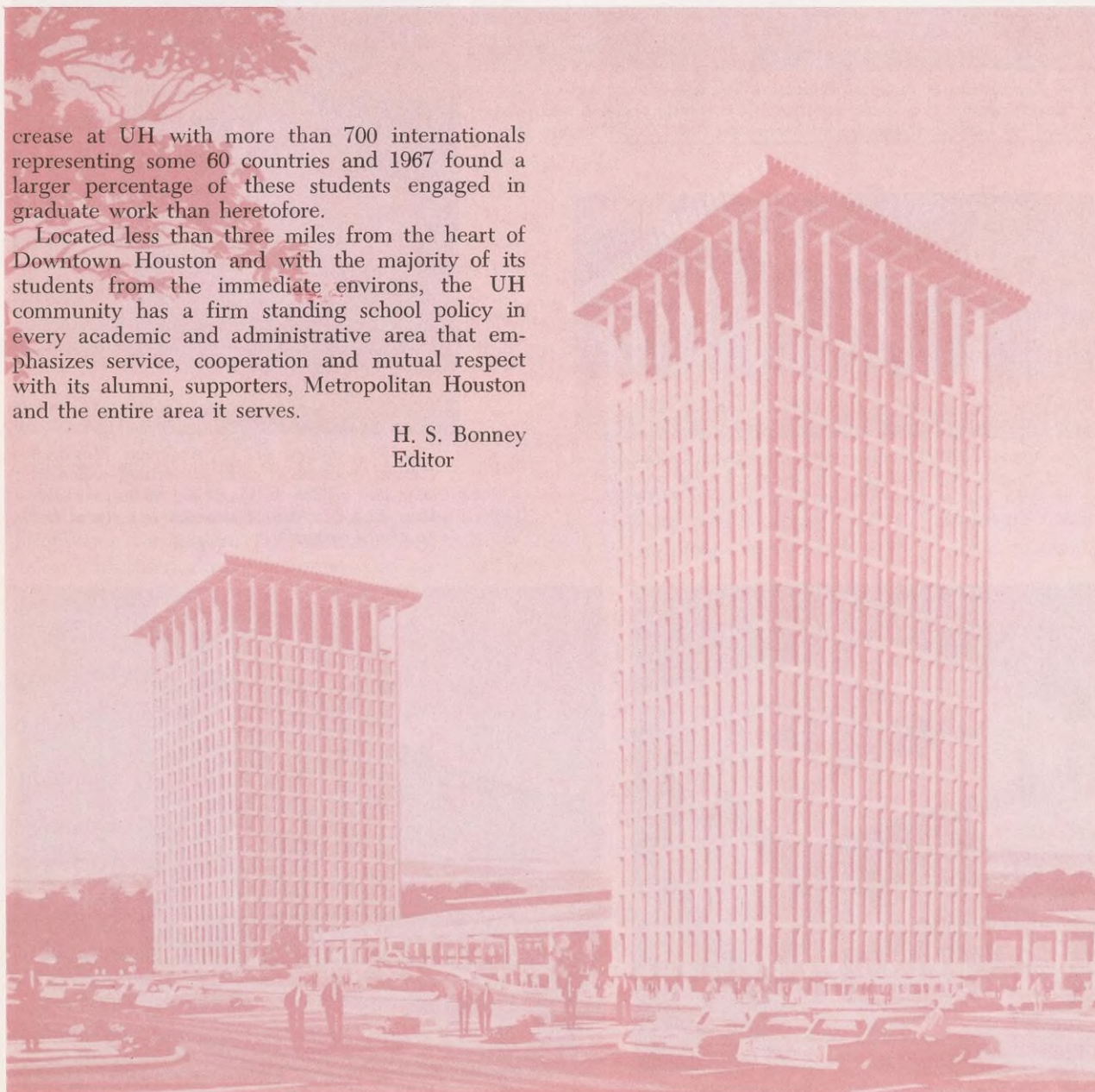
UH's 18-story Twin Tower Dormitories complex now under construction will house 1200 additional on-campus students and its towering height will be a highly observable landmark in south-central Houston.