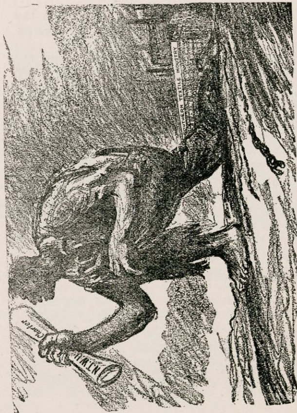
The National Textile Workers Union, a section of the Trade Union Unity League, leads the southern textile workers in the fight for better conditions and for development of working-class power.