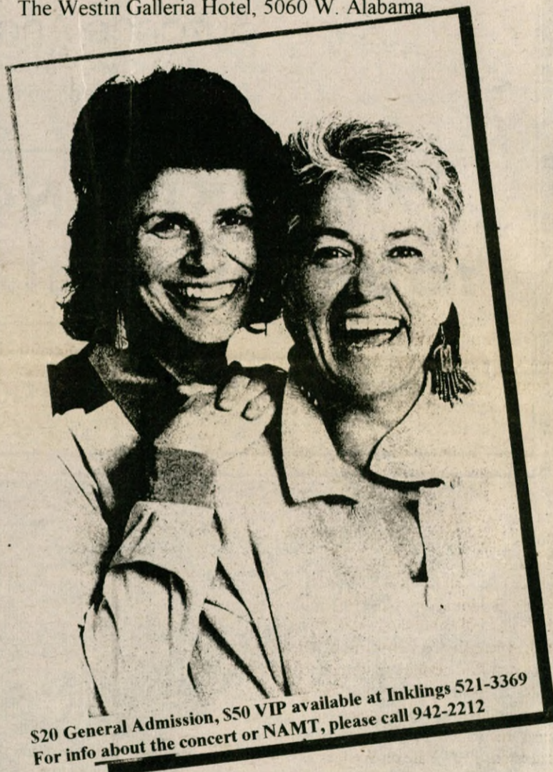
$20 General Admission, $50 VIP available at Inklings 521-3369 For info about the concert or NAMT, please call 942-2212

A Benefit Concert, 9:00 pm Friday, November 17, 1995 The Westin Galleria Hotel, 5060 W. Alabama