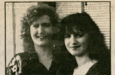
Tracy's Retreat 2404 Montrose Blvd. 529-5330