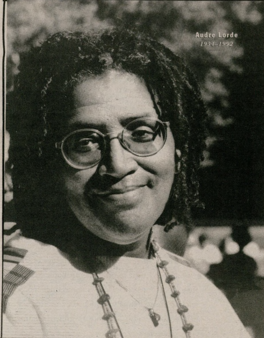
Audre Lorde 1934-1992