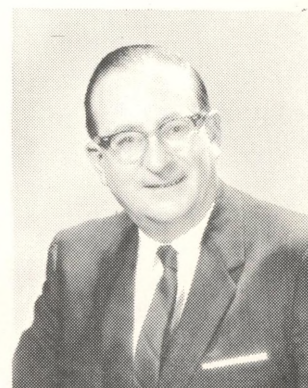
R. H. STINE