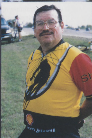
See Alamo City, Page 2

Members of the Shell Deer Park Cycling Team and SERVE supported the American Lung Association with their participation in the Alamo Challenge Bike Tour held on Oct. 14 and 15. In recognition of their combined support, the American Lung Association awarded the Shell Deer Park cyclists and SERVE with a large trophy from the event.