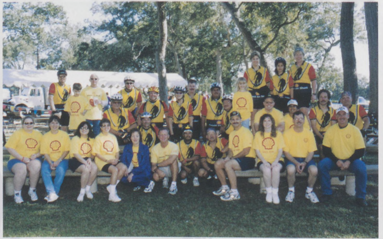
Alamo City continued from Page 1

All inquiries should be addressed to SHELEGRAM, Shell Deer Park P.O. Box 100, Deer Park, TX 77536 713-246-6372 Gina Manlove @ Manlove Advertising 713-477-9781 gina@manlove.com