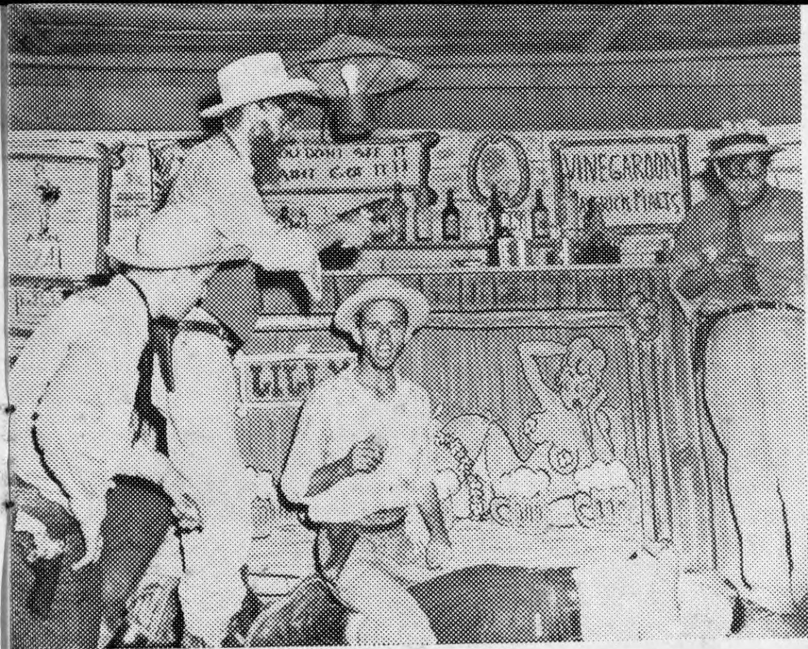
JUDGE ROY BEAN'S court (Above) will be in session again as hard likker and justice are doled out in all the fairness of law West of the Pecos. This scene was snapped at the 1947 version of Bean's court.