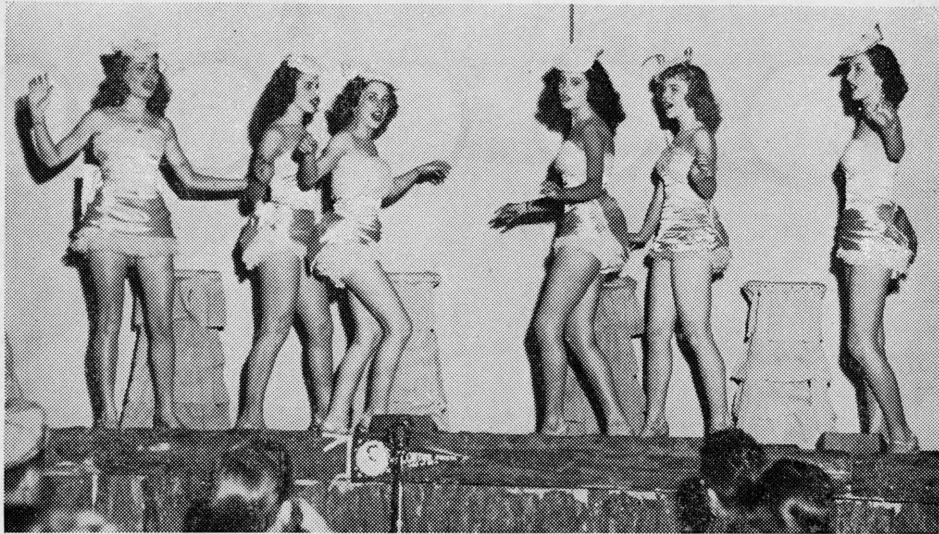
THE CROW'S NEST saloon is famous for its fast-moving song and dance routines. Above is a picture of the Powder Puff Revue

girls as they pace through a routine during the 1948 Fiesta. The Crow's Nest is located on the north end of the Fiesta midway.