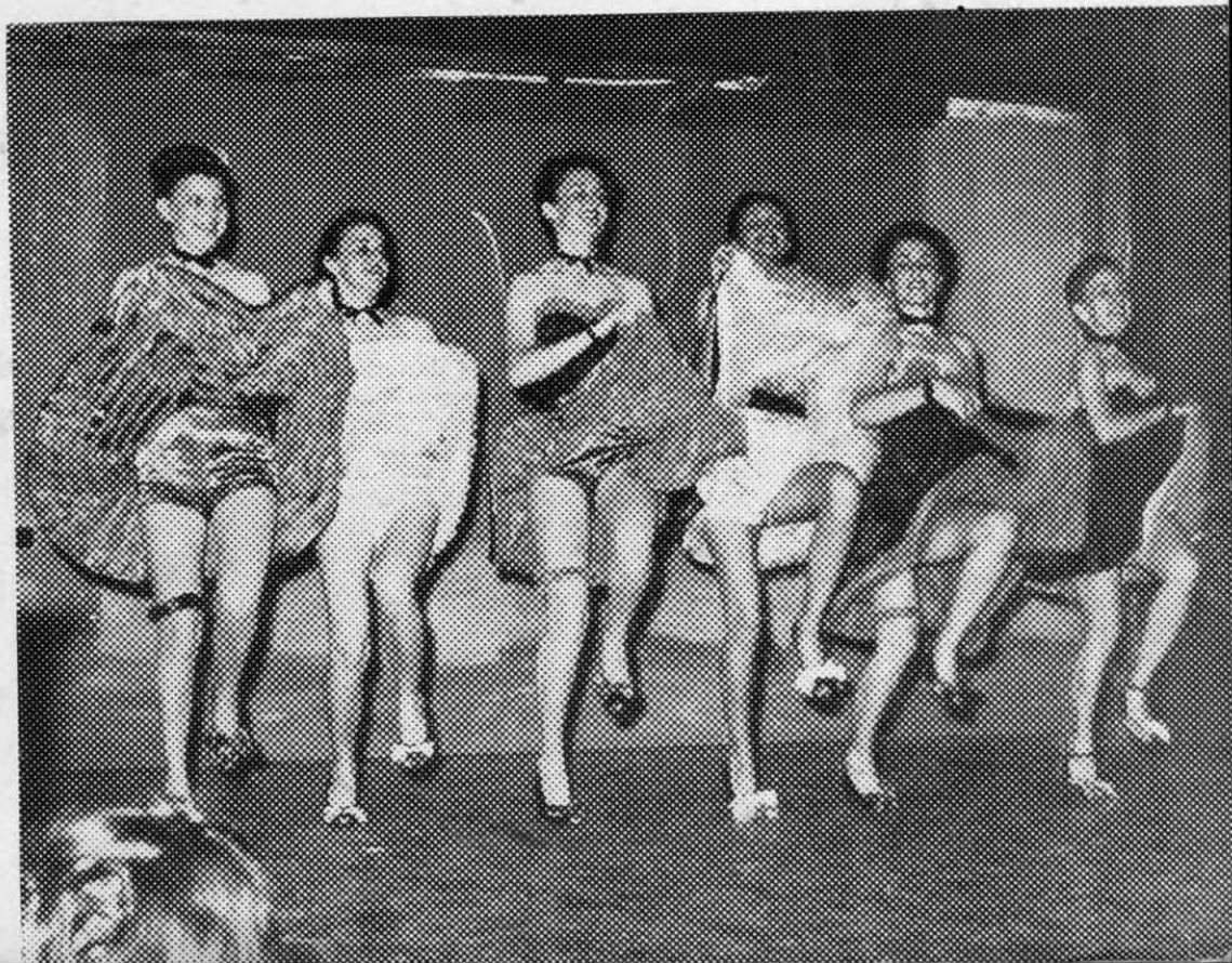
SILVER MOON SALOON chorines (Below) of last year's Frontier Fiesta, will be back again this year to entertain Fiesta visitors.